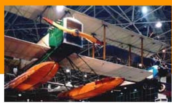
A replica of the Bluebill, in the Museum of Flight, Seattle